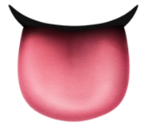
Loss of taste or smell