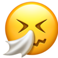
Runny or Stuffy nose