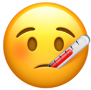
Temp over 100.4